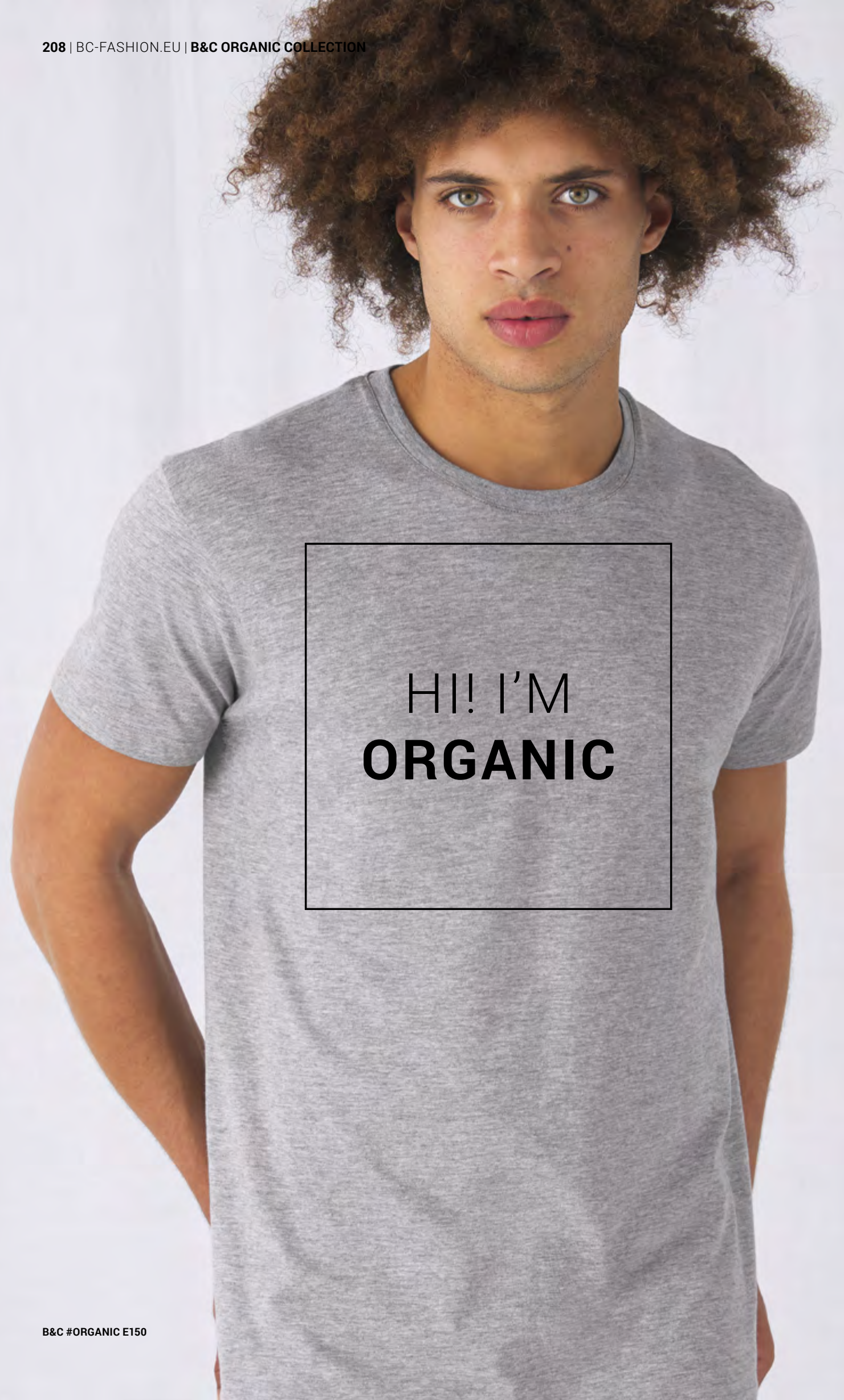
B&C #ORGANIC E150