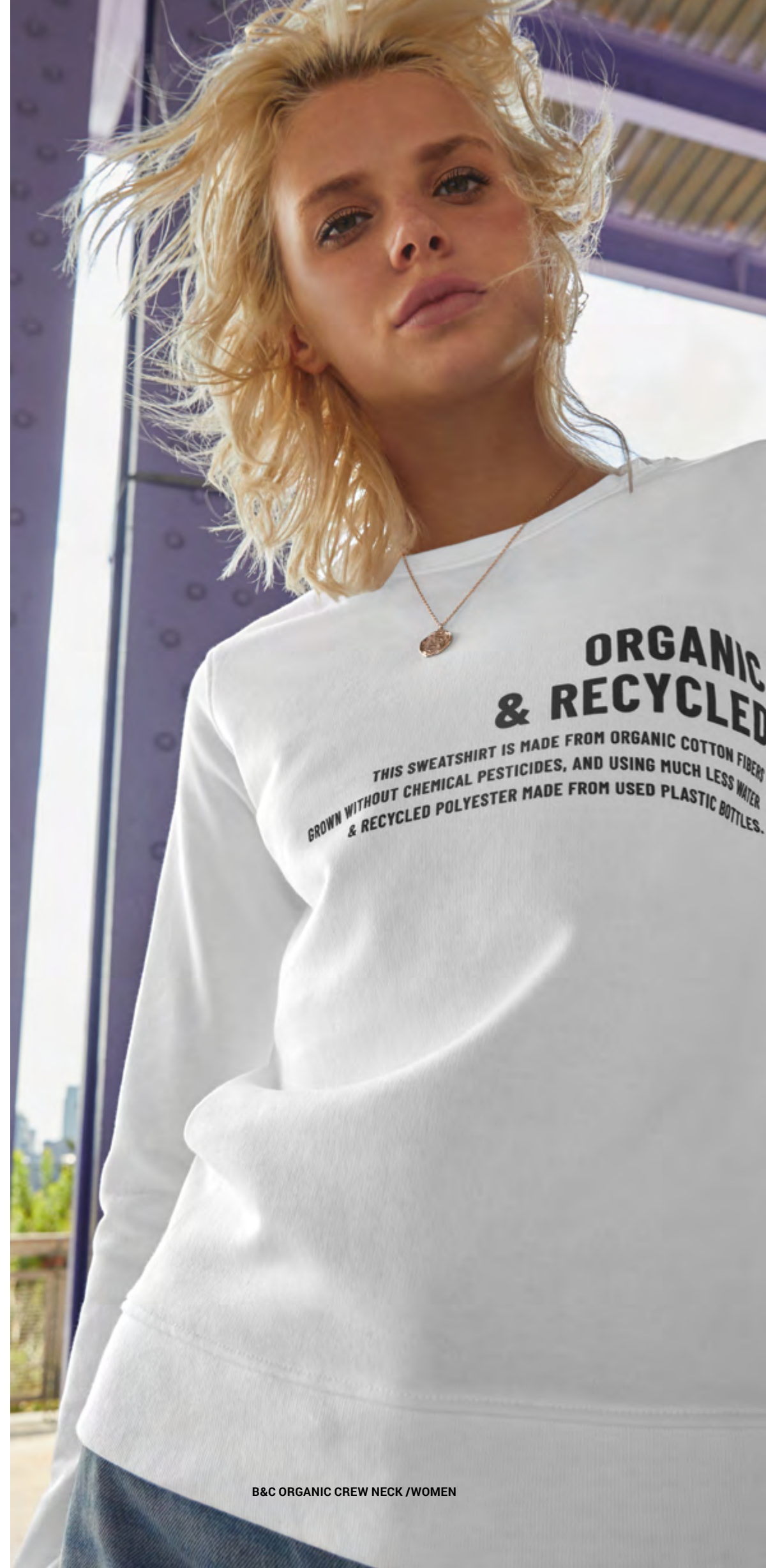
B&C ORGANIC CREW NECK / WOMEN